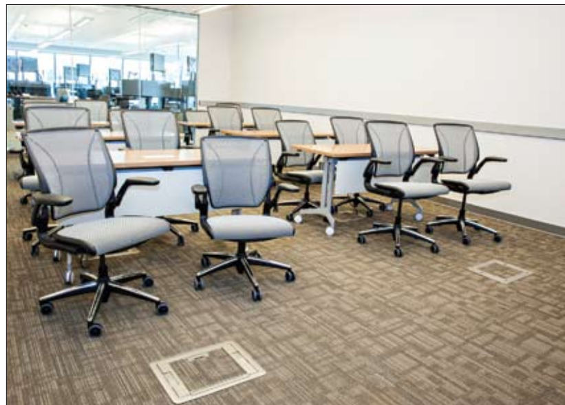
FAULKNER/Application Room View