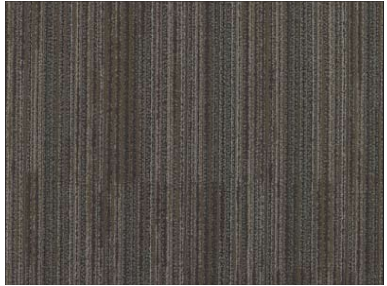
SALT LAKE/Standard Color