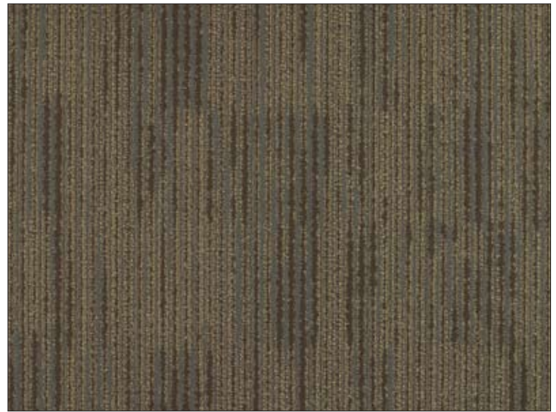
GOLDEN GATE/Standard Color